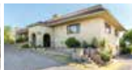
4720 N. Caida Place, Tucson AZ 85718 $760,000 - 4BD, 2BA