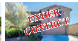
7507 S. Via Rancho La Costa, Tucson AZ $405,000 - 4BD, 3BA

Let us help you buy or sell your property anywhere in Tucson, Vail, Oro Valley, Green Valley, Marana, Sahuarita, Benson or Sierra Vista. We are your resource for all VA related real estate transactions as well as Conventional, USDA and FHA!