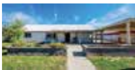
2941 E 26th St Tucson, AZ 85713 $245,000 - 3BD, 2BA