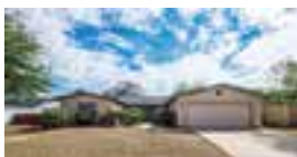
17811 S Tarbela Ave Tucson, AZ 85747 $390,000 - 4BD, 2BA