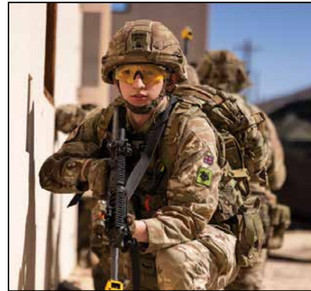
A soldier from C Company 2 YORKS, utilising the the latest technology on Project Convergence.

"It's not only a huge privilege to command a battalion that's been entrusted with such a financial investment, but with such as conceptual investment to redesign and re-imagine how we will fight in the future," he said.