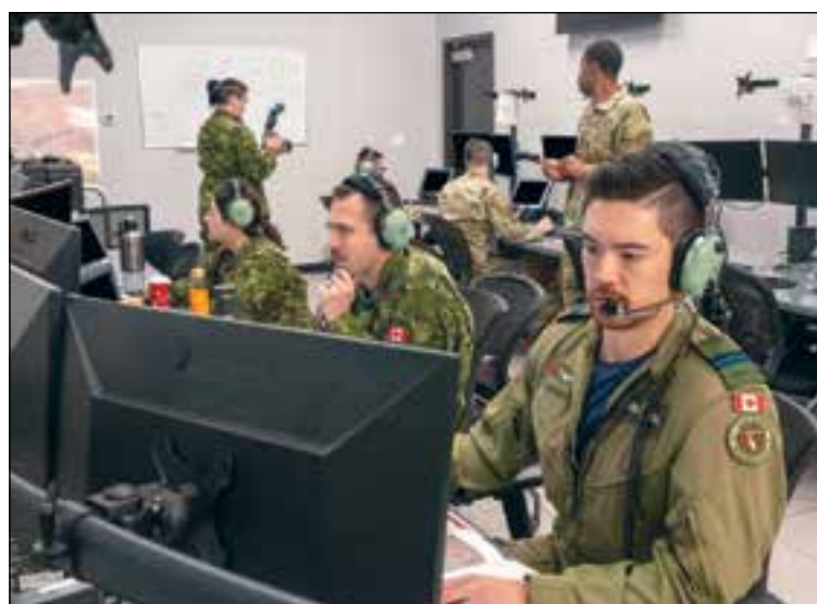
NOV. 23: Royal Canadian Air Force Airmen from 42 Radar Squadron and U.S. Air Force Airmen from the 607th Air Control Squadron control simulated airspaces. Interoperability is a key component of the collective ability to address global security challenges. Exercise Swift Strike aims to strengthen interoperability for American and Canadian air controllers and air battle managers.