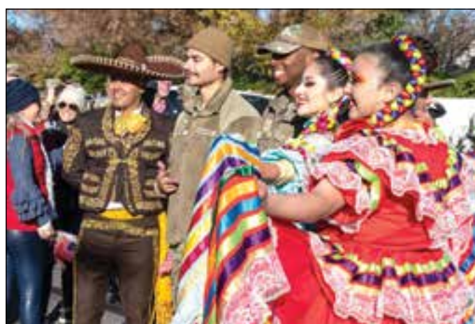
DEC. 17: U.S. Air Force Airmen and Primavera Folklorico Dance Company performers pose for a photo during the Fiesta Bowl Parade in Phoenix. This year marks the 50th edition of the Fiesta Bowl Parade which honors individuals or groups whose actions show a commitment to driving economic growth, championing charitable causes, and executing innovative experiences.