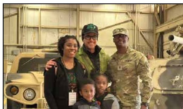
Robert Downey Jr. visited Fort Irwin January 27, 2023 to film part of an episode of "Downey' Dream Cars". The show aired June 22, 2023.