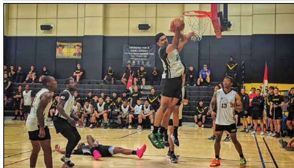
The 2nd Annual Desert Warrior Week Competition saw warriors from across the installation compete in numerous events April 17-21 to determine who earned the Commander's Cup and bragging rights for the next 12 months.