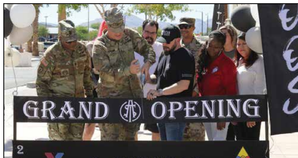
The Fort Irwin Army & Air Force Exchange Service hosted a grand opening for the American Tattoo Society-Fort Irwin tattoo studio August 23, on Fort Irwin. Fort Irwin is the seventh U.S. military installation to open a tattoo studio, with the most recent opening on Fort Moore, Georgia, in July 2023.