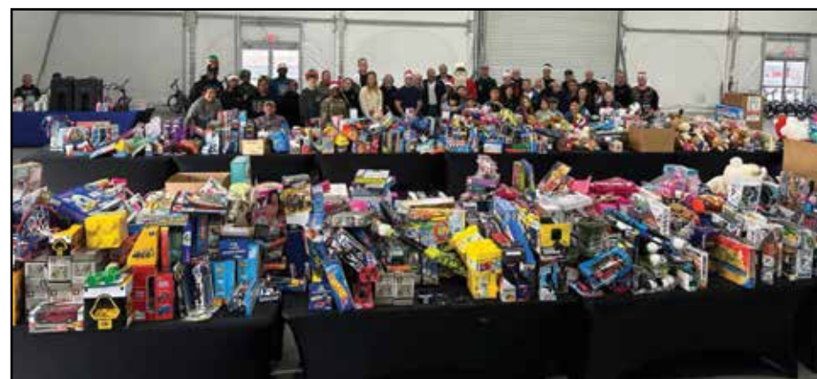
Fort Irwin Family and MWR and Inland Mopar hosted Christmas in January on Fort Irwin, California January 7, 2023.