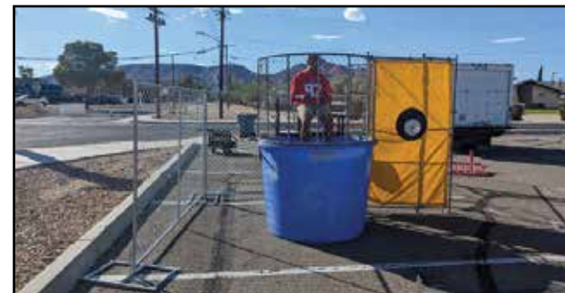
Fort Irwin Family and MWR hosted a Community Block Party at Jack Rabbit Park July 29, 2023. There were bounce houses, waterslides, a dunk tank, car show, FRG tables, and other community resources.