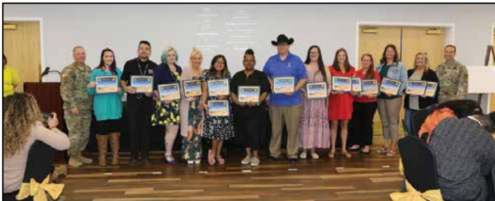
The National Training Center and Fort Irwin hosted a Volunteer of the Year Ceremony on Fort Irwin April 19, 2023.