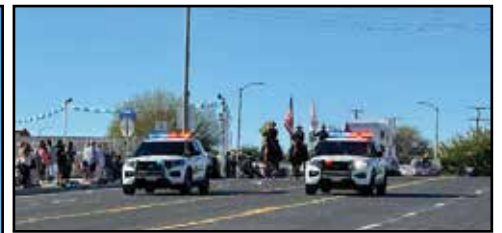
Soldiers from the National Training Center and Fort Irwin supported Veterans Day events all over Southern California November 11, 2023.