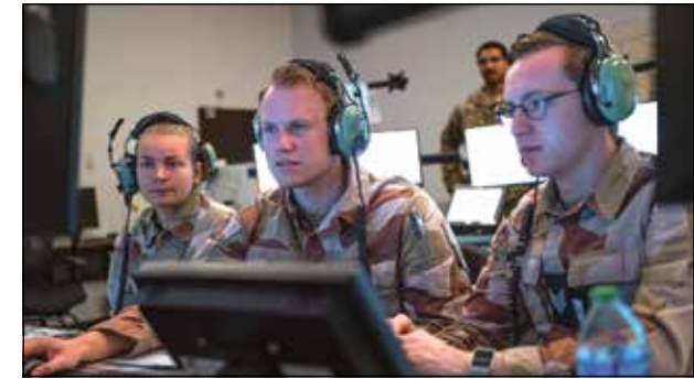
U.S. Air Force illustration by Airman 1st Class Mason Hargrove

Royal Norwegian Air Force aircraft controllers engage in a training mission during exercise Desert Viking, March 10, 2023, at Luke Air Force Base, Arizona. Desert Viking is a bilateral military exercise between the U.S. and Norway designed to strengthen interoperability between the two countries.