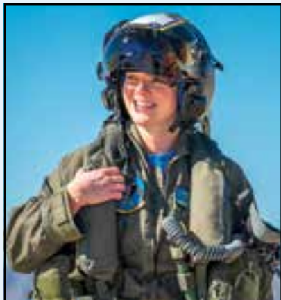
LUKE SUPPORTS FLYOVER