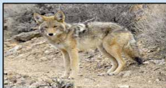
DPW PUBLIC SERVICE ANNOUNCEMENT 04 Jan 2022