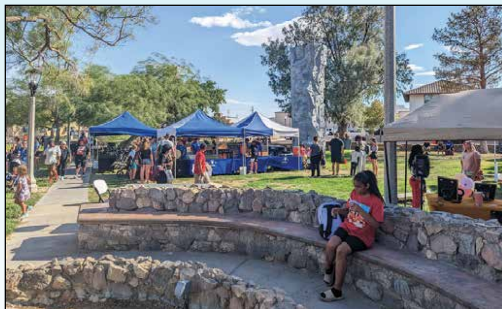
Fort Irwin and the Family and Morale, Welfare and Recreation Directorate hosted a Community Block Party at Jack Rabbit Park on Fort Irwin, California, July 29, 2023. Entertainment included bounce houses, waterslides, a dunk tank, car show, and informational booths.