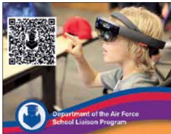
U.S. Air Force graphic illustration