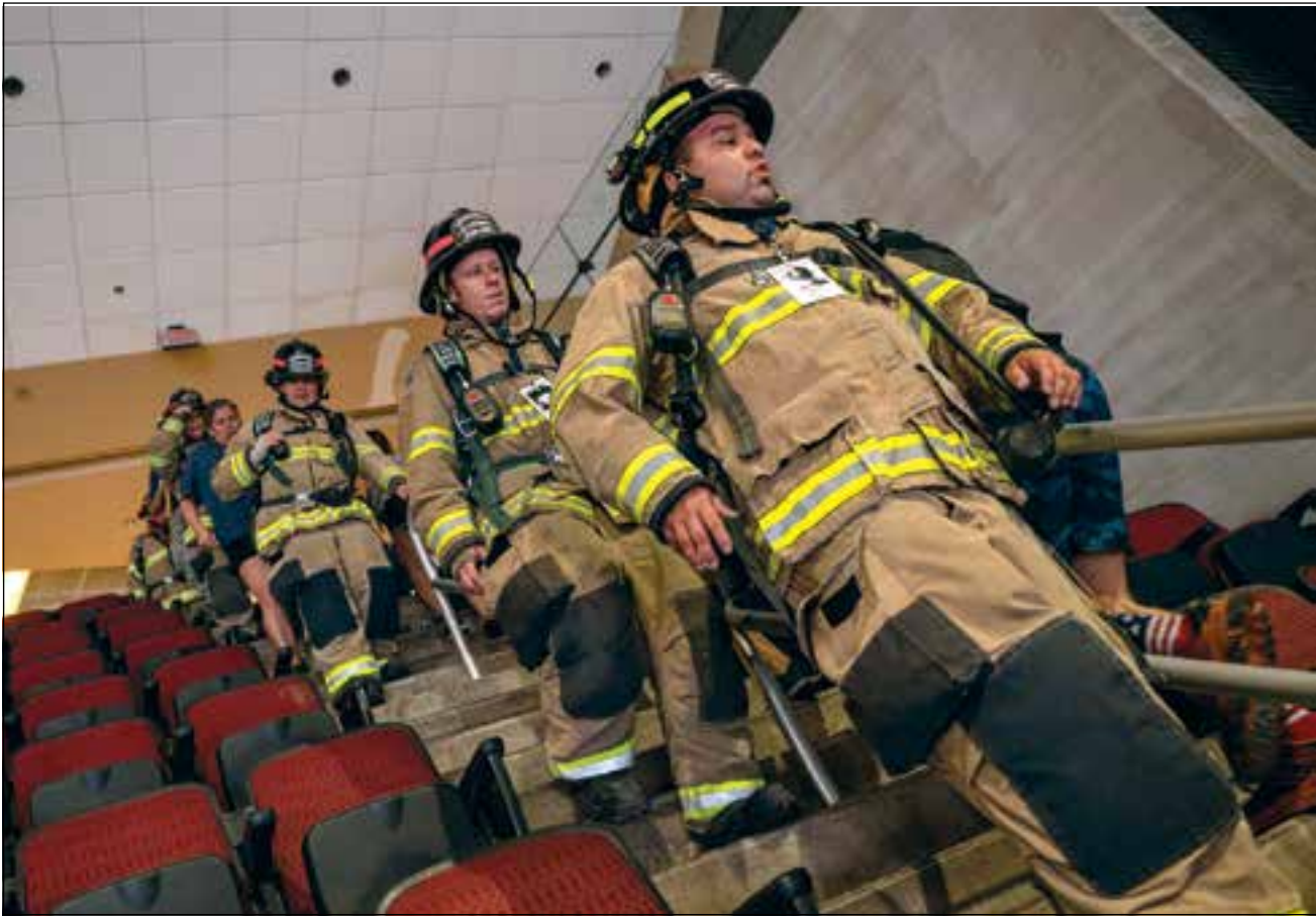
Firefighters from the Maricopa Fire Department, walk down stairs during the 2022 Tower Challenge, Sept. 9, 2022, at Gila River Arena, Glendale, Arizona.