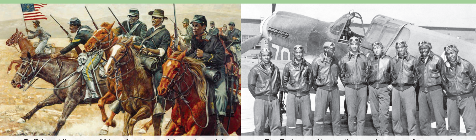
Buffalo soldiers were African American soldiers who mainly served on the Western frontier following the American Civil War.