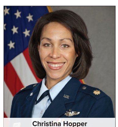
First African-American Fighter Pilot.