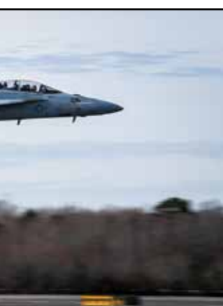
avy photograph by PO3 Caledon Rabbipal