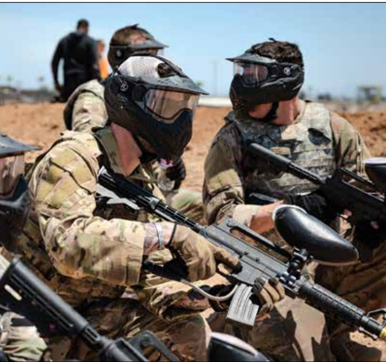
U.S. Air Force Airmen attending the John J. Rhoades Airman Leadership School plan their next moves in an area active with armed enemies, May 2, 2025, at Luke Air Force Base, Arizona. Under pressure from base volunteers acting as paintball-armed threats, ALS students cleared areas for personnel transit and established a secure operational zone. The team of Airmen also received a refresher on tactical combat casualty care during the exercise, critical skills for field operations.