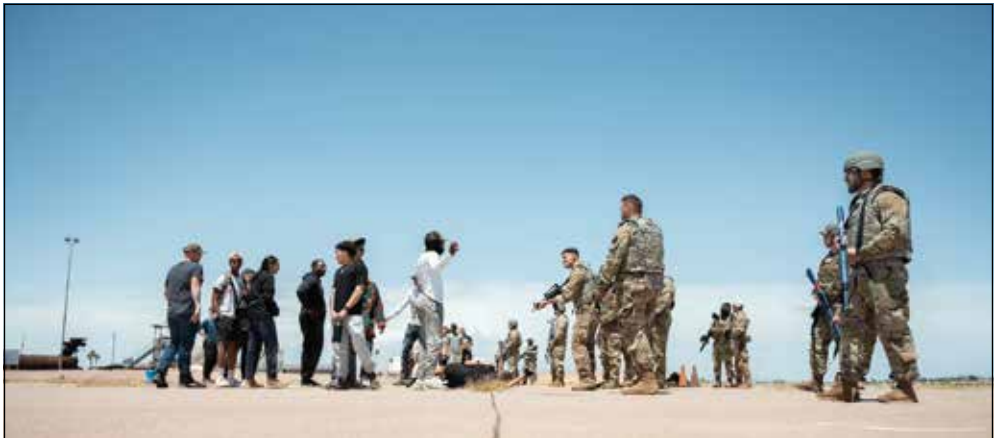
U.S. Air Force airmen assigned to the 56th Fighter Squadron role-play as antagonistic threats against Airman Leadership School students, May 2, 2025, at Luke Air Force Base, Arizona. Instructed to be confrontational, the volunteers aimed to challenge the soon-to-be non-commissioned officers' ability to manage unruly crowds and uncontrollable individuals, observing the students' reactions.