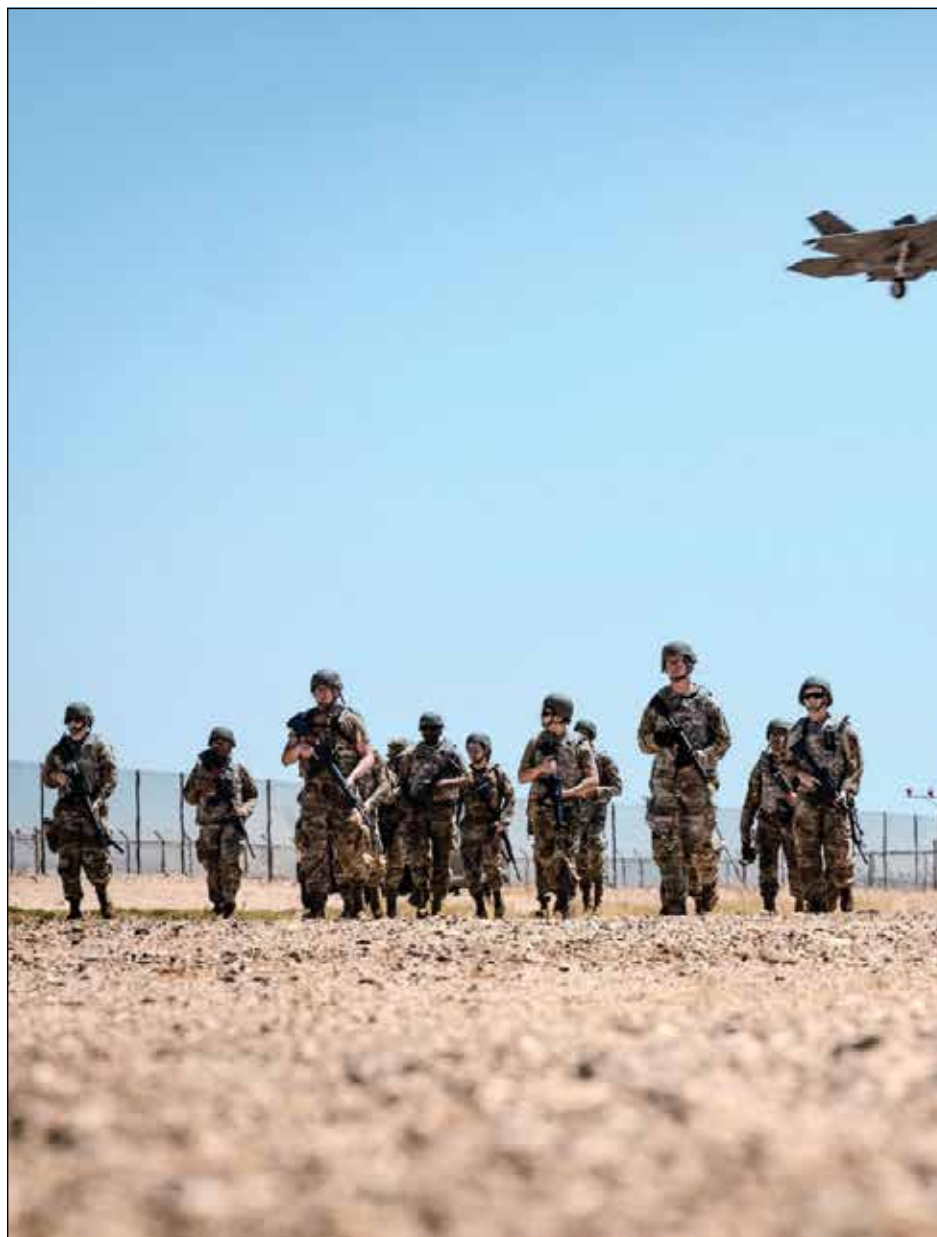
U.S. Air Force Airmen attending the John J. Rhoades Airman Leadership School to land, May 2, 2025, at Luke Air Force Base, Arizona. Ready Airman Training, a combat casualty care, runway repair, and clearing buildings. The students, drawn officers in the Air Force.

At Luke AFB, the commitment to creating combat-ready Airmen and training the world's greatest fighter pilots is always key. This vital mission is made possible by the dedication of all Airmen across the base who work tirelessly in maintaining our aircraft, ensuring we are always ready for tomorrow's challenges.