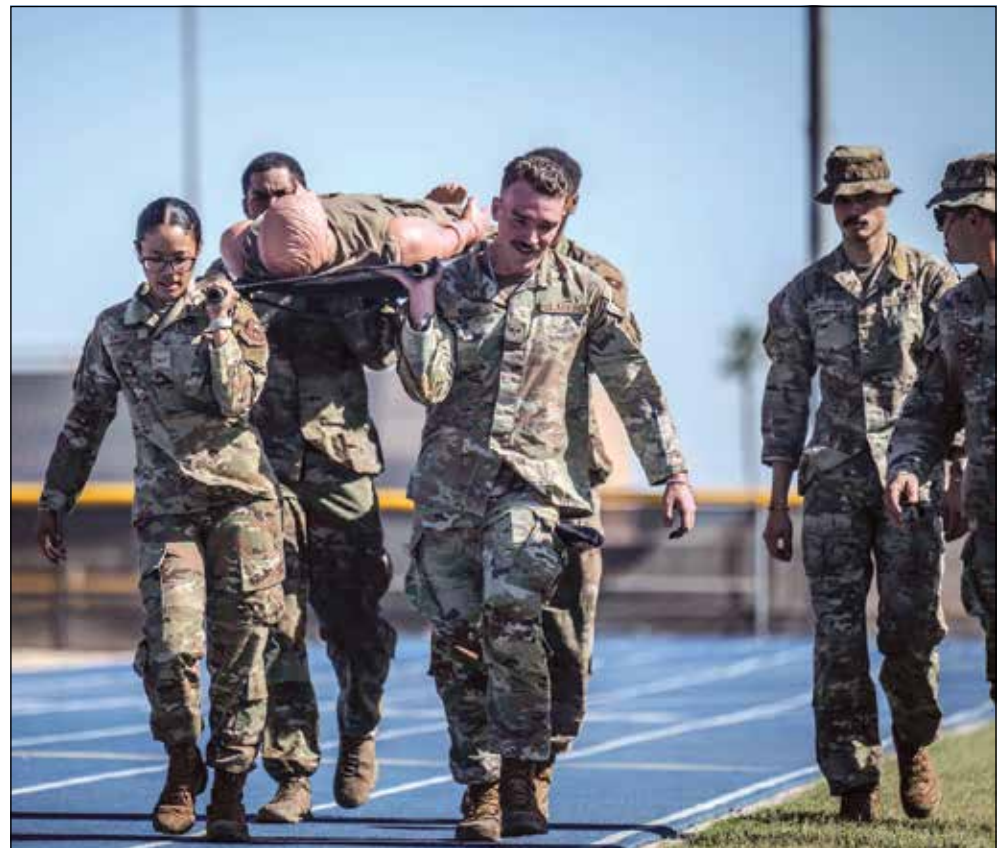
U.S. Air Force Airmen assigned to the 56th Security Forces Squadron move a simulated casualty during the 2025 Police Week Defender Challenge, May 13, 2025, at Luke Air Force Base, Arizona. The Defender Challenge consists of various strength and endurance trials, and is part of National Police Week, which honors the men and women of law enforcement agencies around the country, while remembering those who gave their lives in service.