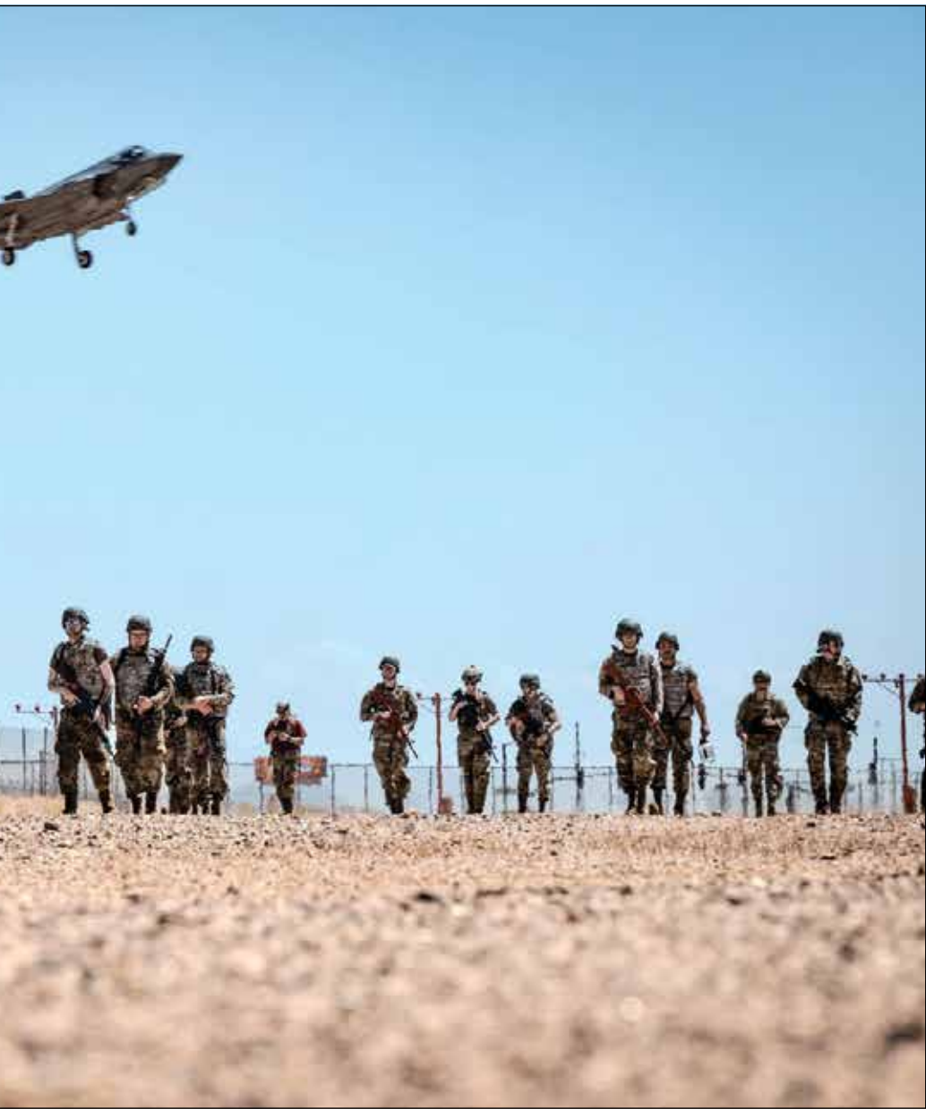
A cool march to a forward operating point near the flightline as an F-35A Lightning II prepares for a day of hands-on training in which all ALS students participated, included tactical personnel drawn from various career fields, are preparing to become future non-commissioned