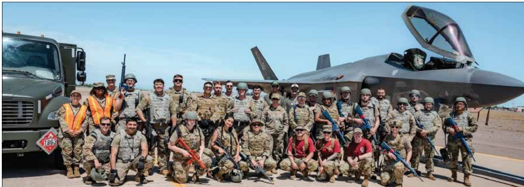
U.S. Air Force Airmen assigned to the 56th Fighter Squadron pose for a photo with a fueling truck and F-35A Lightning II, May 2, 2025, at Luke Air Force Base, Arizona. Refueling marked the final portion of their Mission-Ready Airmen training, providing a hands-on perspective on the basics of fighter jet refueling. This training is essential for the future non-commissioned officers to understand the planning and materials needed for such an effort in real-life scenarios.