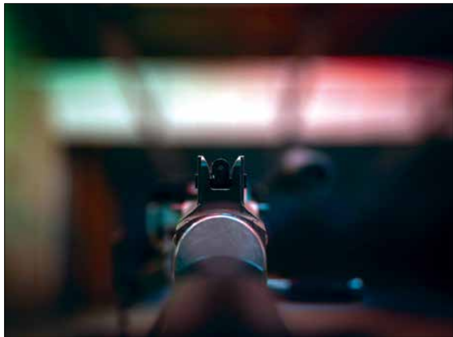
A M240B medium machine gun stands as a part of a weapons exhibit during National Police Week, May 13, 2025, at Luke Air Force Base, Arizona. The exhibit showcased various weapons platforms employed by U.S. Air Force Security Forces including sidearms, rifles, and machine guns. National Police Week honors the men and women of law enforcement agencies around the country, while remembering those who gave their lives in service.