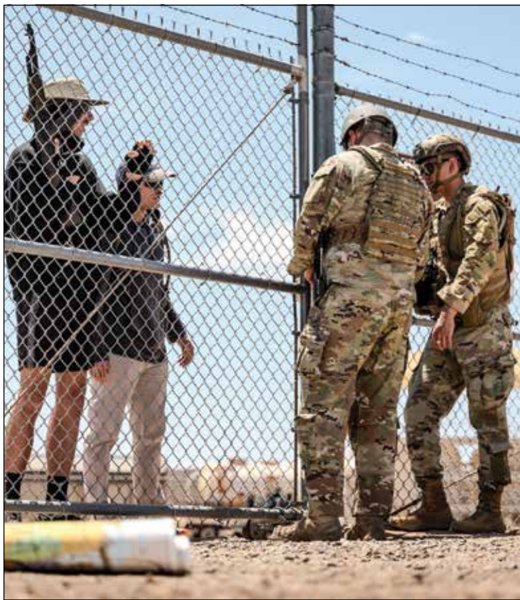
U.S. Air Force Airmen assigned to the 56th Fighter Wing, participate in a final hands-on training, May 2, 2025, at Luke Air Force Base, Arizona. To simulate real-world challenges, base volunteers role-played as both helpful good Samaritans and hostile enemies. This dynamic environment required the Airman Leadership School students to apply their newly learned skills in de-escalating tense encounters and establishing secure guarded perimeters.