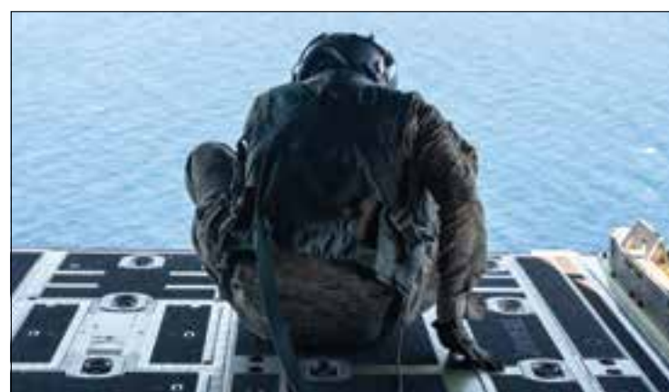
A U.S. Air Force Airman assigned to the 563rd Rescue Group observes an HH-60G Pave Hawk receive aerial refueling over the Pacific Ocean off the coast of San Diego, Nov. 15.

This undertaking demonstrated one of the ways Davis-Monthan's culture of readiness and problem-solving skills can support the greater joint force, our mission partners and local communities.