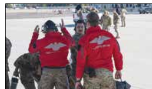
U.S. Air Force Airmen assigned to the 563rd Rescue Group gather their equipment and prepare to board one of their HH-60G Pave Hawks at Coronado, California, Nov. 15.